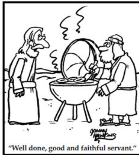
from JoyfulNoiseletter.com

The church will provide the hot dogs. Please bring a salad, dessert or casserole to share. REMEMBER to bring chairs and something to drink.