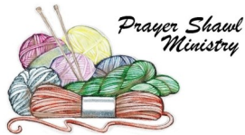
KNIT. CROCHET. PRAY.